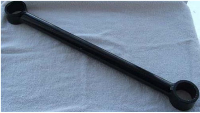
Metric Lower Arm Metric Upper Arm